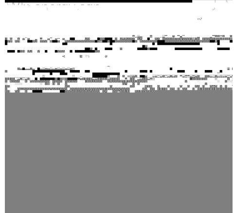
2.5MW/5MWh BESS Single-line Diagram